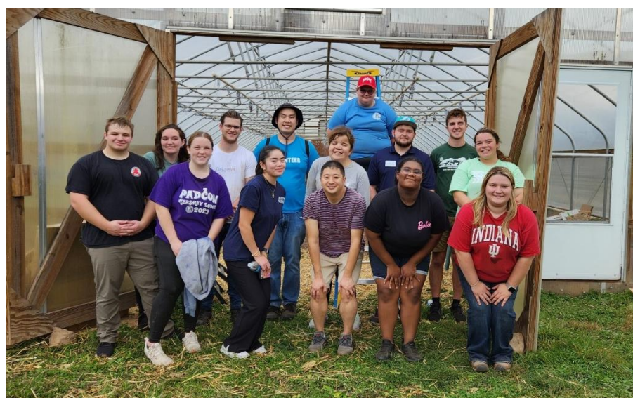
Top: InterPACK attendees help set up the greenhouse for next year's planting season. Above: Group photo outside the greenhouse.

We hope more members will be able to attend next year! For more pictures, please check out the pacirclek.org or our social media.